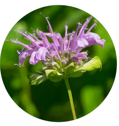
Supporting Land Managers

We connect individuals with the training, tools and support they need to be or become land managers and true stewards of their communities.