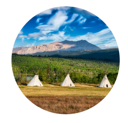
Protecting our Lands

We connect individuals with the training, tools and support they need to be or become land managers and true stewards of their communities.